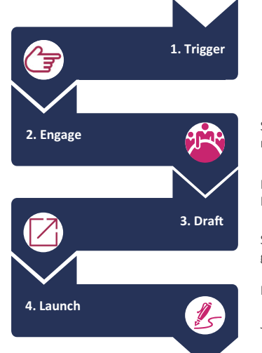
Figure 2 Stages and steps for developing and implementing the sustainable finance framework in Cambodia

May 2016 – ABC joined SBN and issued a Statement of Intent to develop Sustainable Finance Principles, in collaboration with the Ministry of the Environment and the National Bank of Cambodia.