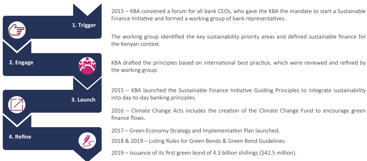
Figure 2 Stages and steps for developing and implementing the sustainable finance framework in Kenya