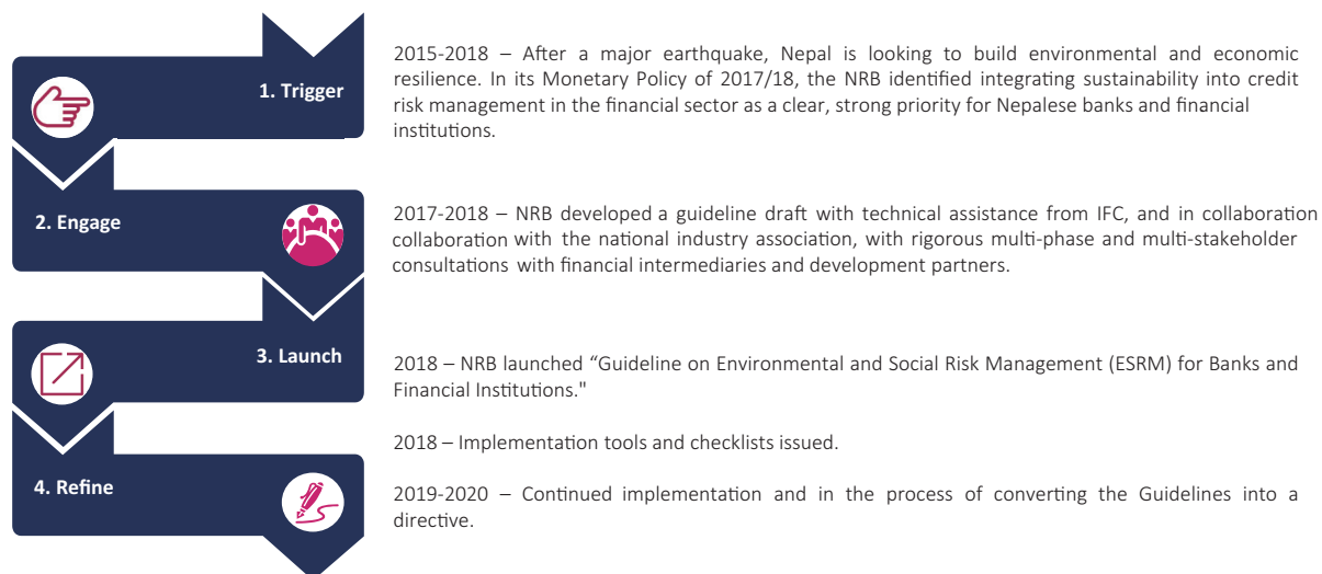
Figure 2 Stages and steps for developing and implementing the sustainable finance framework in Nepal