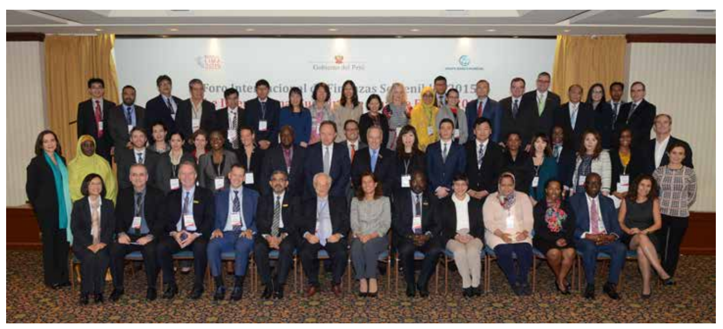
Members of the Sustainable Banking Network (SBN) and representatives of partner agencies (IFC, SECO, UNEP FI, GIZ) at the one-day roundtable discussion with banking regulators on 17 September 2015, Lima, Peru.

There is also increasing interest in other aspects of sustainable finance beyond environmental and social risk management policies, such as financing green and inclusive business models, managing carbon footprints, applying carbon pricing, and assessing climate risks.